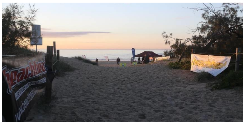
Comp was held at pincushion – access 141!