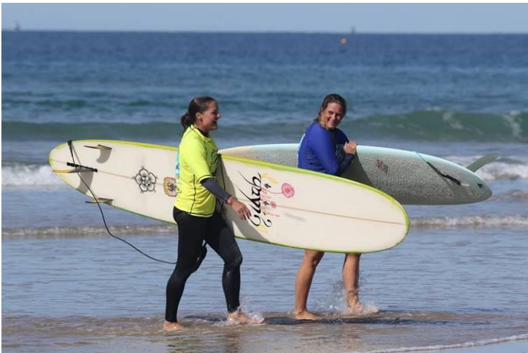
Bluey and Cath!