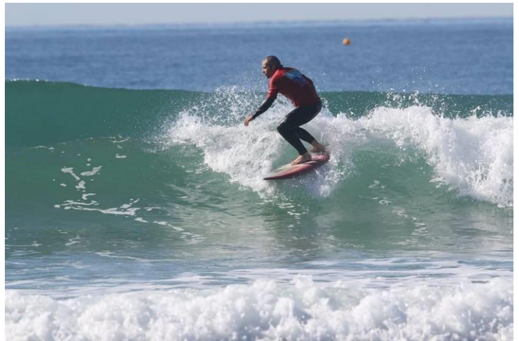
Springer on wave of the day!