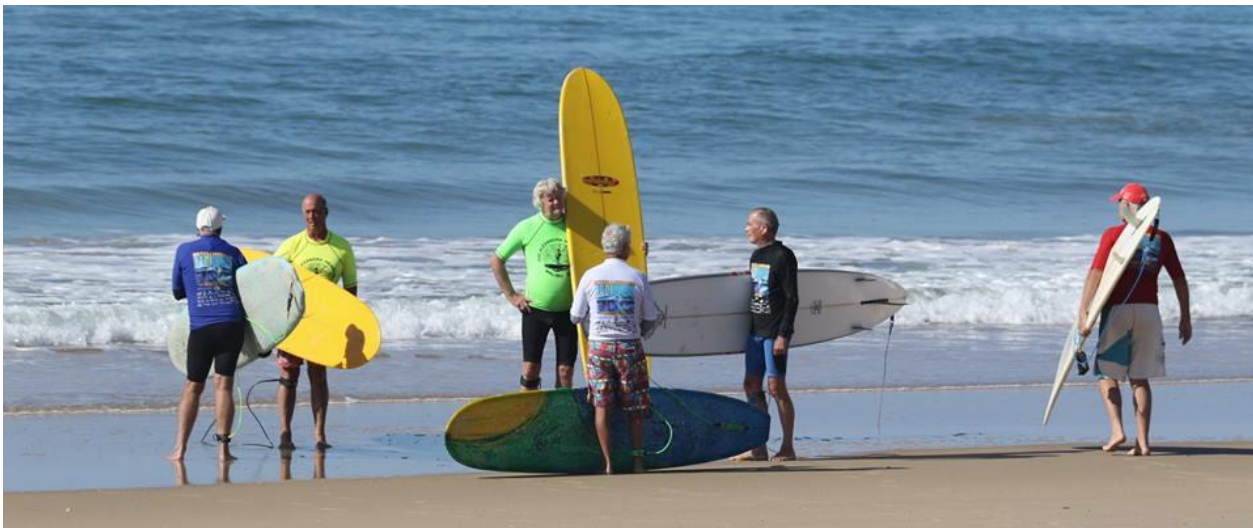
Over 65's men heading out for their heat!