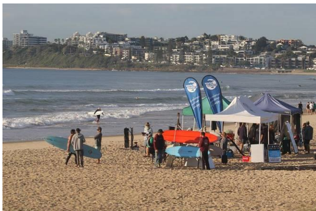
Great view of Maroochydore to Alex!