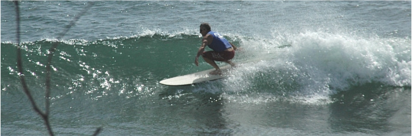
"Who took the photo Dave" with a sunny one.