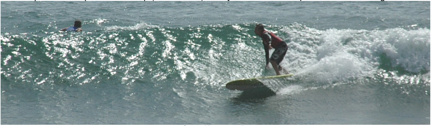
Gazz with some wall.

Below pics from Septembers Comp (on Oct 4 th !?). They make it look heaps better than I thought it was.