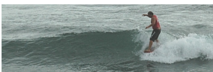
Cam, still on the nose...