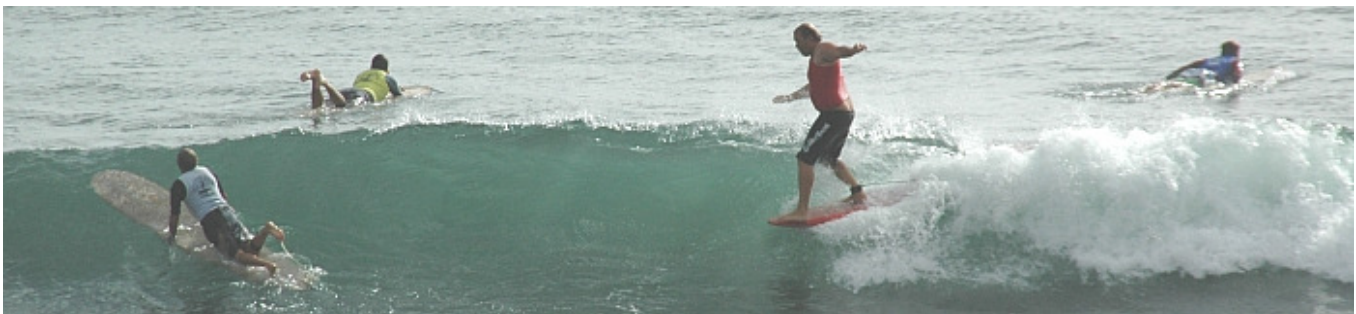
Cam showing the others in the heat where to place a 100kgs for maximum points on what looks like a very short 9 footer.