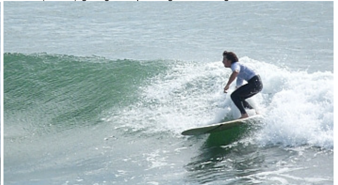
Gents looking fast