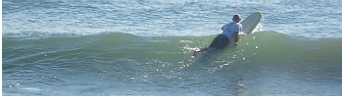
a lazy longboarder lounges over a lump looking for a larger one

For more contest info goto: www.australianlongboarding.com Send classifieds or any other worthy addition to; web@alexmalclub.org.au