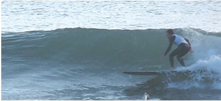
Benny (I think) above and below