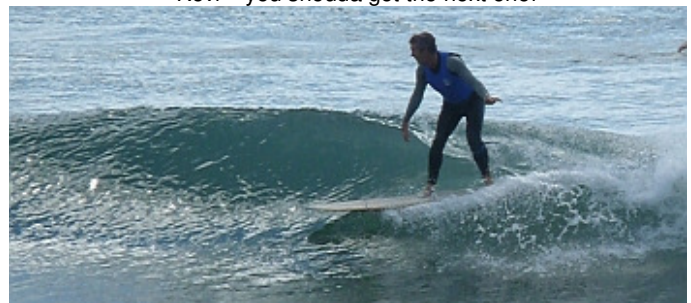
Lookout, there's no turning here