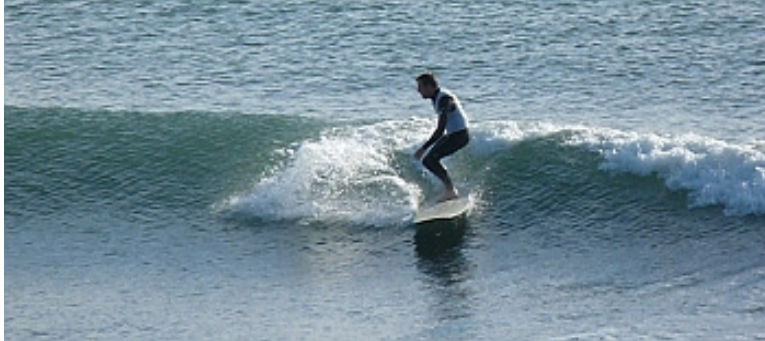
Old mal cruizin