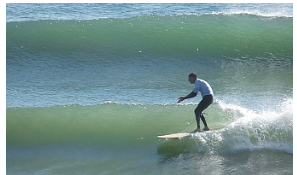
Kevi – you shouda got the next one!