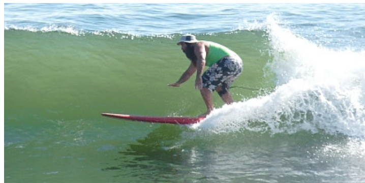
Grant on a tasty little Bluff peeler