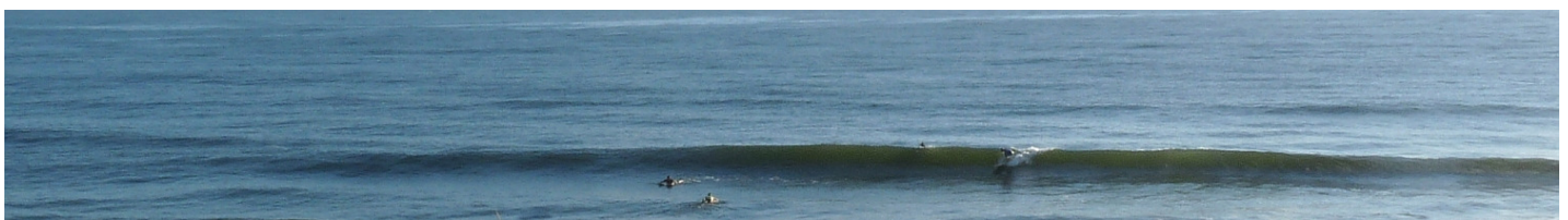
Feb Comp day – soft & warm early morning joy.

PS – Remember, no comp this weekend because of the Mooloolaba Triathlon, so seeya the weekend after (3 rd Apr).