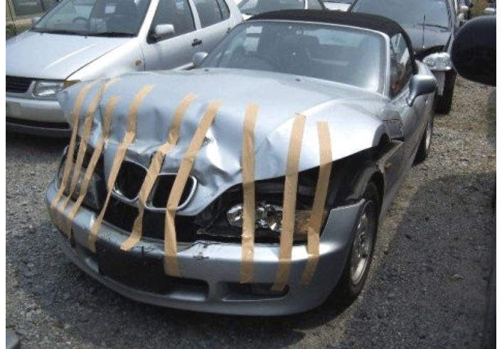
Duct tape – fix a diff or fix a Beemer (sorry Marcus even in that state it's still worth more than $1000)