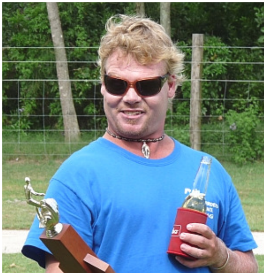
A shocked Snowman – Most improved!!