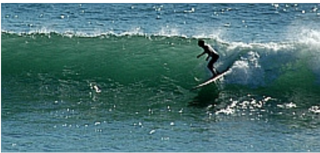
Hookin' into a nice wave – nearly head-high on Ferrett