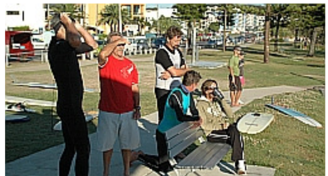
Sunday chillin' on the hill.

Editorial Spit: The club first started in 1982 and has developed a strong relationship with the Bluff. The current members owe it to future members and the future of the club, to resist or stop, development that erodes our lifestyle. We should be reclaiming the serenity of our coastal space, not putting bus lanes through it.