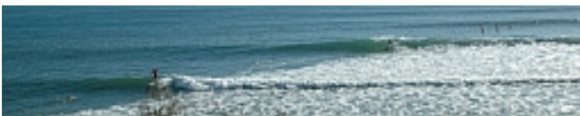
This is what Wayne and Gillies (see pic on right) are looking at.

So when the stock market plunges 200 points, where does that money go? Into safer investments like lottery tickets?