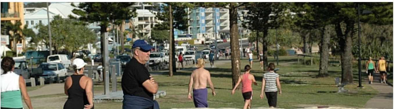
We need to piss off all the bloody pedestrians and build a bus lane, brilliant.