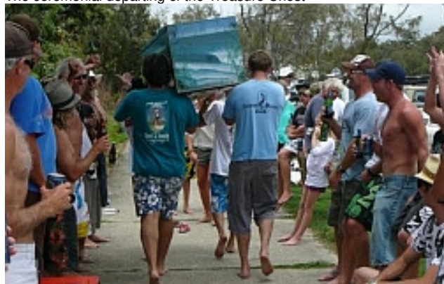
A big cheer as the Treasure Chest passes the guard of honour.