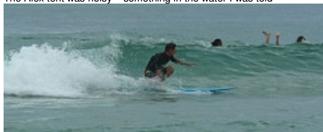
Kevi screaming down the line (probably hasn't gone left in years)