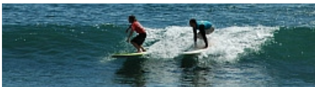
Making the small conditions more interesting