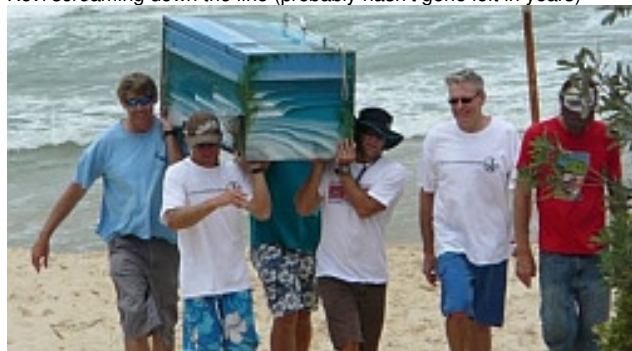
The ceremonial departing of the Treasure Chest