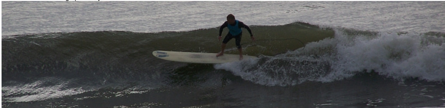
My God! Is that Snowman? High and Loose!