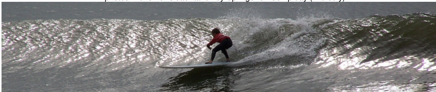
A Gen 3 Coulter slicing up a shiny one.

All photos in this newsletter taken by Springer on Comp day (27th July)